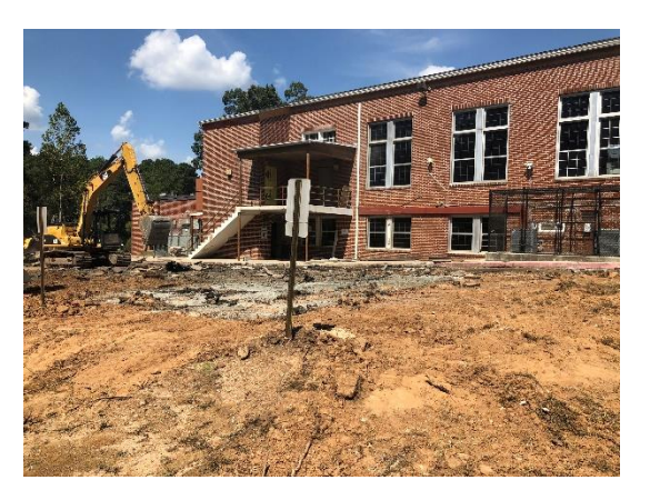
Asphalt Demolition at Rear Parking Lot