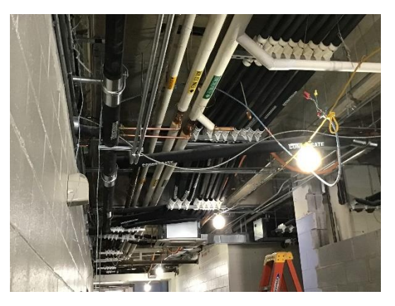
Building 2033 Aluminum Line Removal