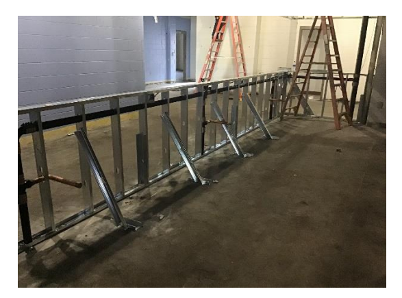
Building 2040 In Wall Rough In